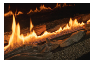
optional ceramic logs or white stones (installed on top of the burner)